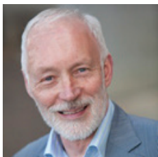
Patrick McGorry FRCP, M.D., Ph.D. Past-President