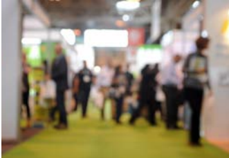
Exhibit in the foyer space just outside of the registration desk for a chance to network with more than 450 attendees in the field of Suicide Research or have a larger booth set in the poster hall. *Price for exhibit only package includes (1) 6' table, (2) chairs, (1) easel, and electrical outlet if requested. It also includes (1) exhibitor badge to the conference.