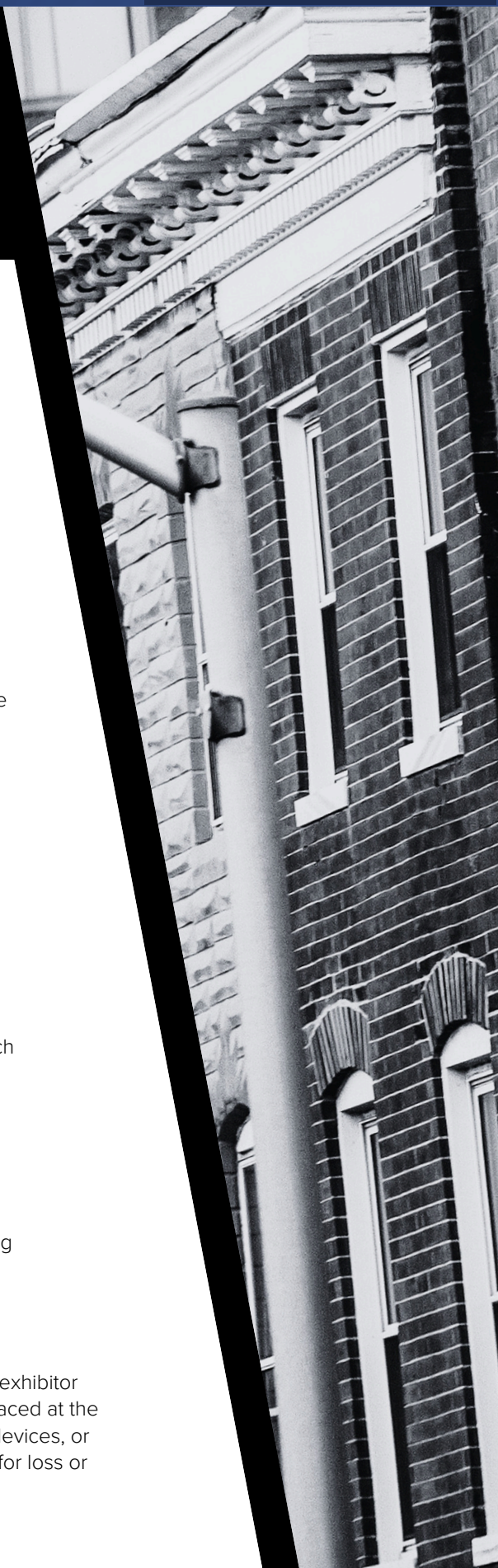
Exhibit Management will provide peripheral security of the exhibits area. However, each exhibitor should make provisions to safeguard their goods and materials from the time they are placed at the booth until the time they are removed. Do not leave laptop computers, other electronic devices, or other valuable equipment in the exhibits area unattended. ISTSS will not be responsible for loss or damages for any cause.